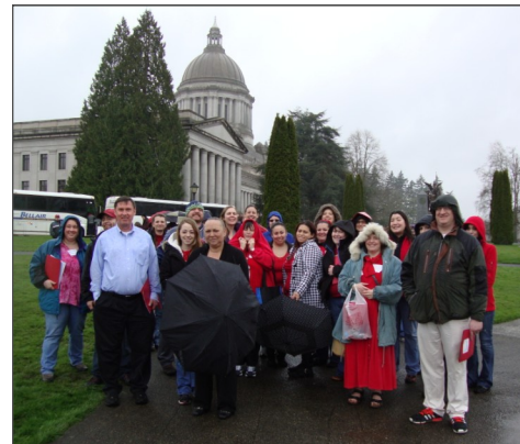
Parents advocating for early learning

“EOCF coordinated over 100 family engagement events in 2014-2015.”