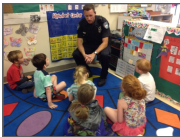
Learning about police work

Parents with enrolled children volunteer in the classroom, organize events, serve on Parent Policy