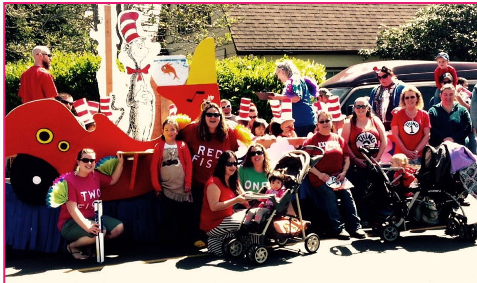
EOCF's Long Beach Early Learning Center Children's Loyalty Day Parade 2015—First Place Trophy

educational opportunities for children & families